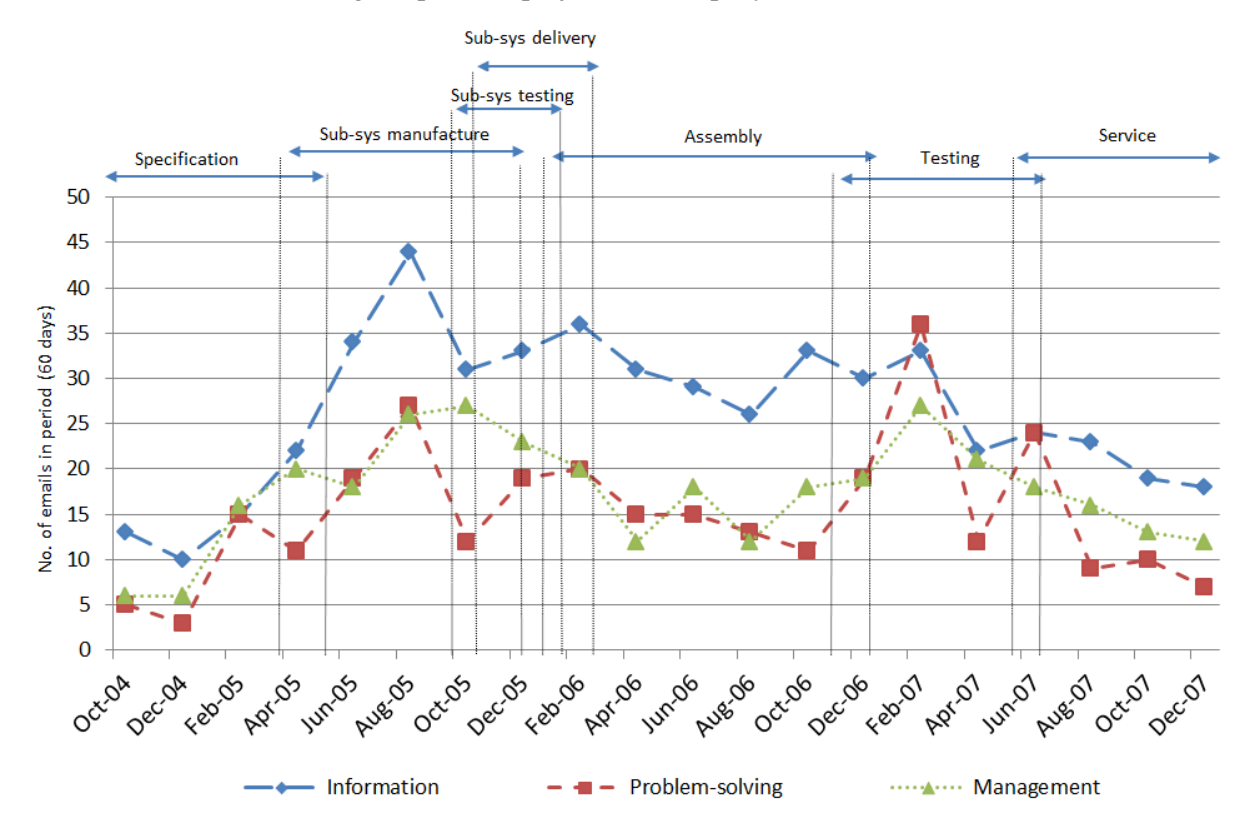
Figure 1. Time-phased numbers of email concerning information sharing, management and problemsolving

For each of these stages a time-phased analysis of the number of emails relating to the dimensions of What and Why was performed. Figure 1 shows traces of the time-phased numbers of email concerning information sharing, management and problem-solving. Figure 2 shows traces of the time-phased numbers of email concerning the product, project and company.